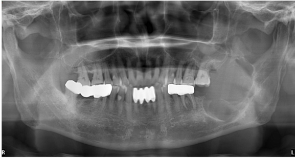
Fig. 2. Panoramic radiograph shows a multilocular radiolucent tumour with clear margins in the posterior mandibular body and the anterior of the mandibular ramus.