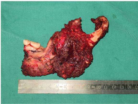
Fig. 3. The specimen of tumour after mandibulectomy.