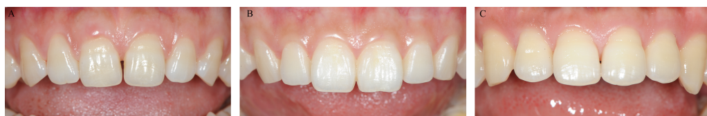
Figure 1 Representative maxillary sextant group. (A) No contact point; (B) Complete papilla; (C) Deficient papilla.